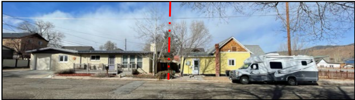
Above: Subdivided corner Lot Directly West across L Street from Subject Lot; the newer home (at left) was built in 1957.