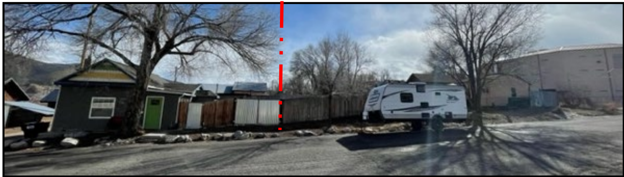
Below: Subdivided Corner Lot Directly South across Alley from Subject Lot; the newer home (at right) was built in 1932.